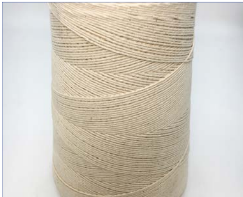
Butcher's Twine Cone without Red Tail