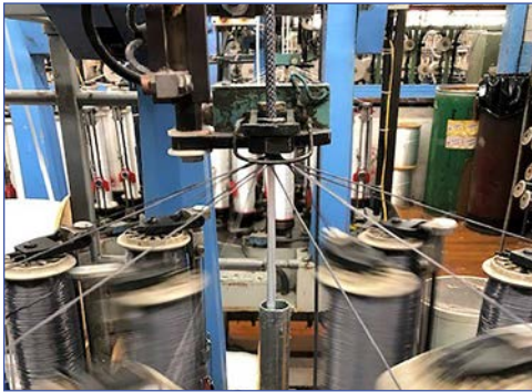
Manufacturing Solid Braid Nylon Rope Made in the U.S.A.