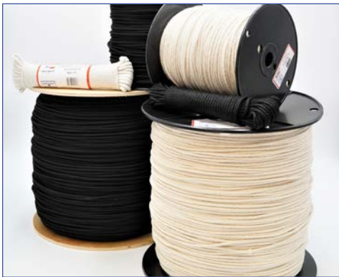
Trick Line/Tie Line