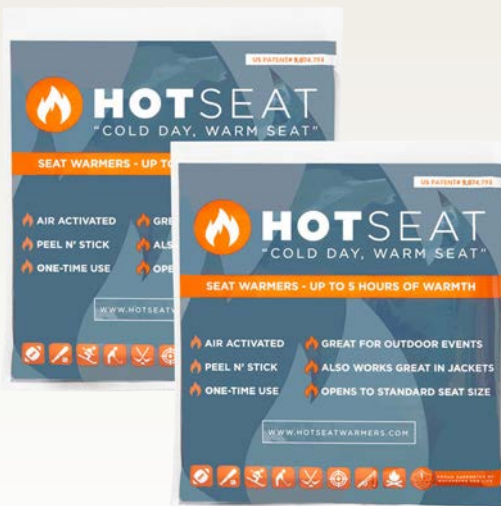
Hot Seat-Seat Warmers