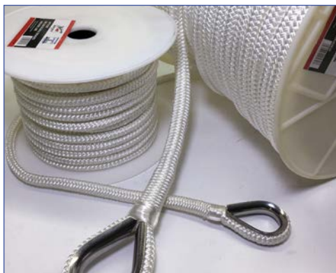
Anchor Line-Nylon Double Braid