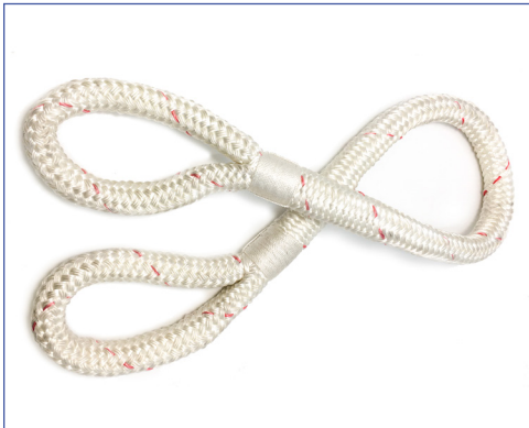
Double Braid Rope with Eyes