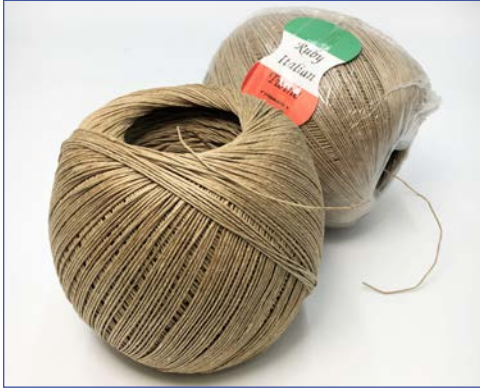
Italian Ruby® Sausage Twine