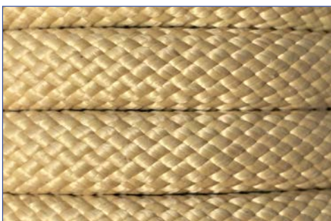
Aramid Fire Rope Tech-Kern