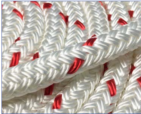
Double Braid with Eyes-Portland Performance