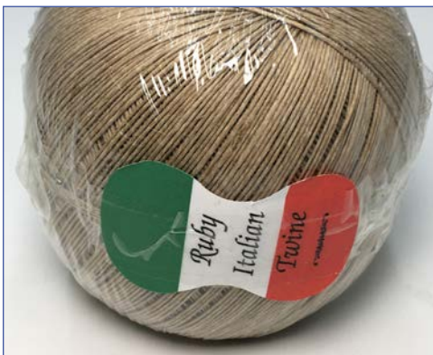
Italian Ruby® Stitching Twine