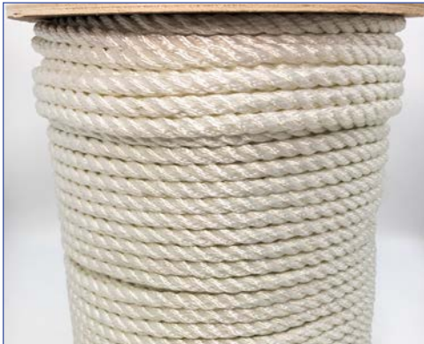
Nylon Rope 3-Strand Twisted