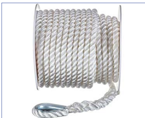
Anchor Line-Nylon 3-Strand