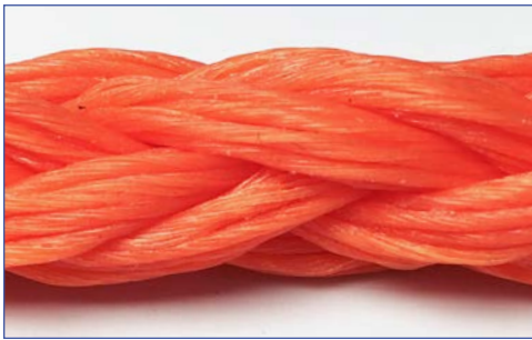
Hy-Dee Brait Dielectric