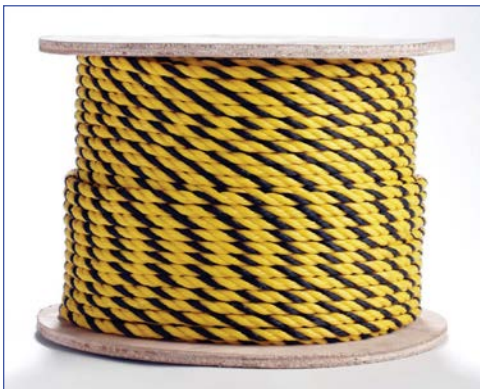
Yellow and Black Polypropylene Rope