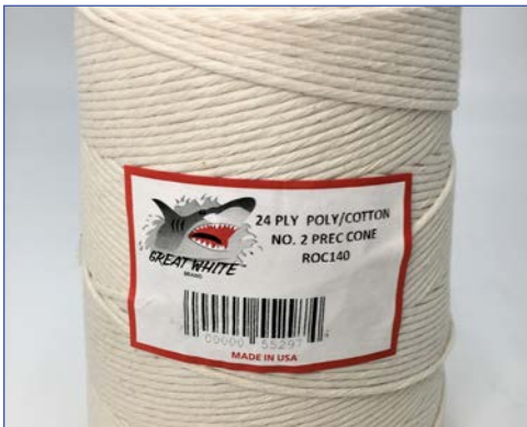
Butcher's Twine Cone