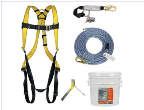
Fall Protection Kit