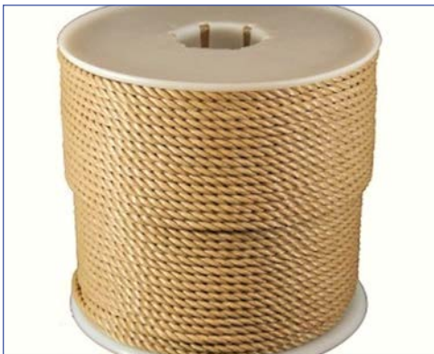
Un-Manila Polypropylene Rope