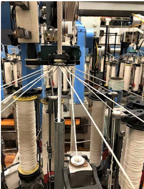
Manufacturing Sash Cord-Made in the U.S.A.