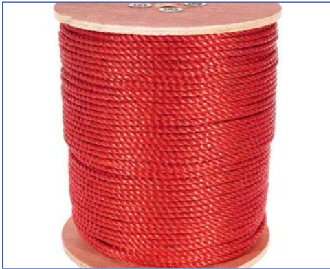
Red Polypropylene Rope