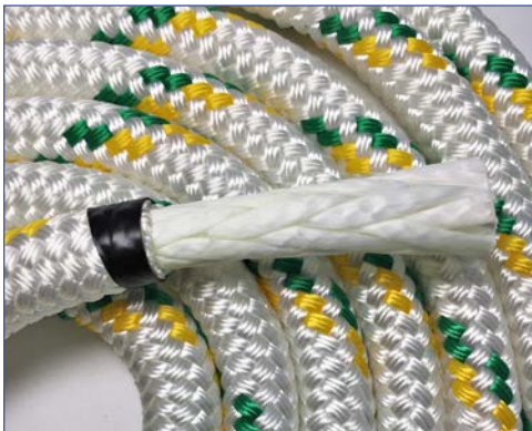
Ultrex Plus Double Braid-UHMWPE