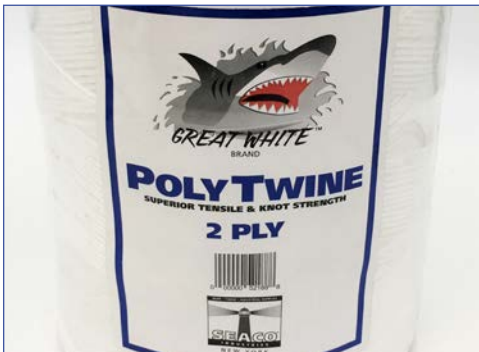
2-Ply Poly Twine