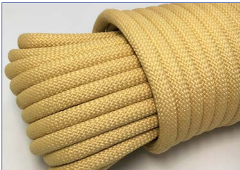
Aramid Fire Rope