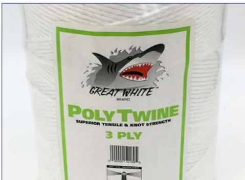
3-Ply Poly Twine