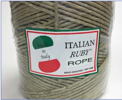
Italian Ruby® Rope