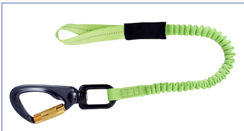
Tool Tether Lanyard