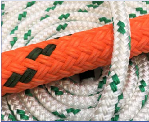
Double Braid Rope with Eyes-Double Esterlon