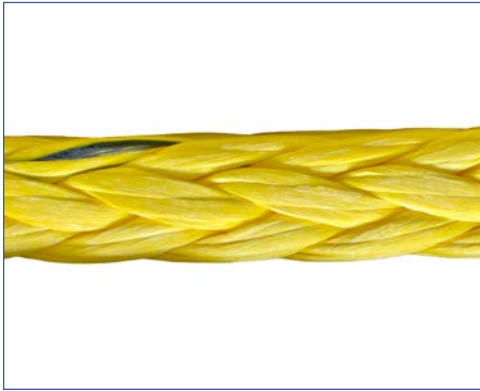
Sierra 75 12-Strand-UHMPE