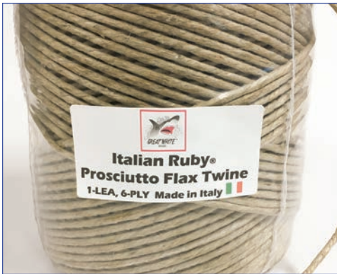
Italian Ruby® Prosciutto Twine