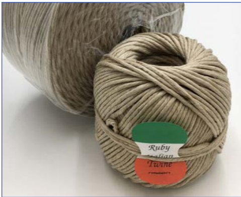
Italian Ruby® Spring Twine