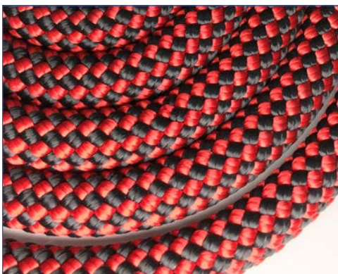
Arborist Rope Kernmaster