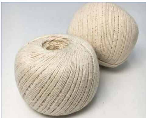
Sausage Twine Ball