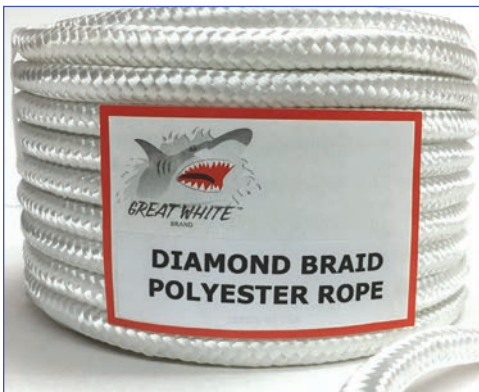
Diamond Braid Polyester Rope