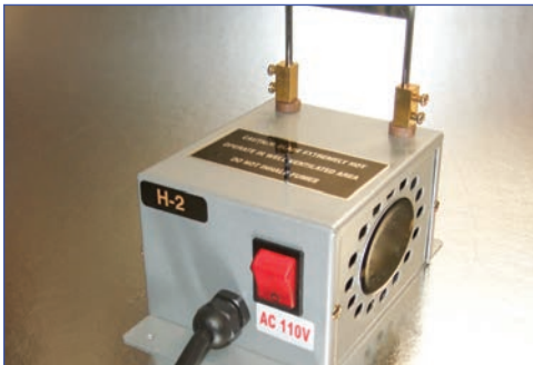
Electric Rope Cutter