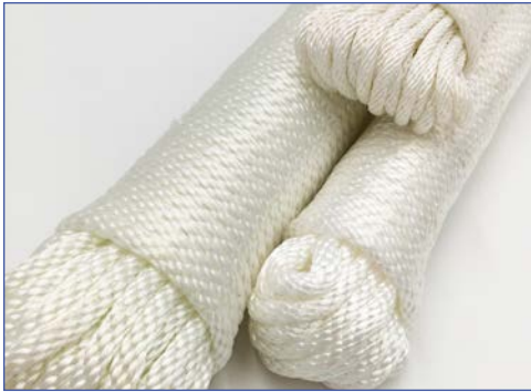
Solid Braid Nylon Rope/Flagpole