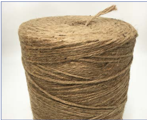
Jute Welt Cord