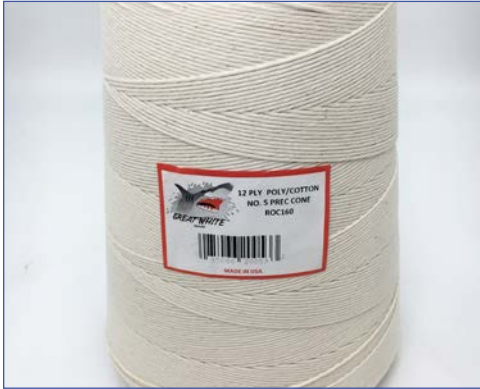
Butcher's Twine Cone with Red Tail