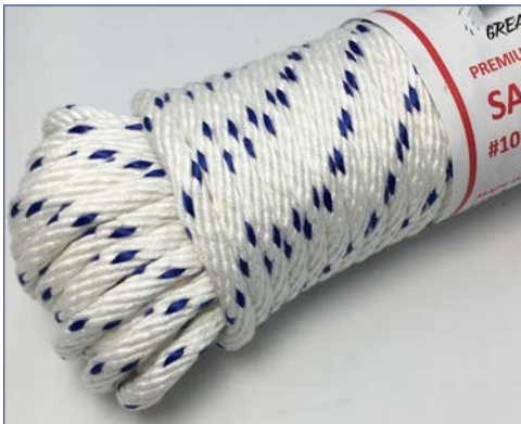
BluTrace™ Sash Cord