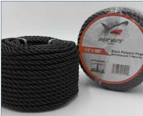
Black Polypropylene Rope