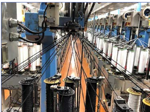
Manufacturing Utility Rope-Made in the U.S.A.