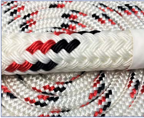
Maxibraid Plus Double Braid-UHMWPE