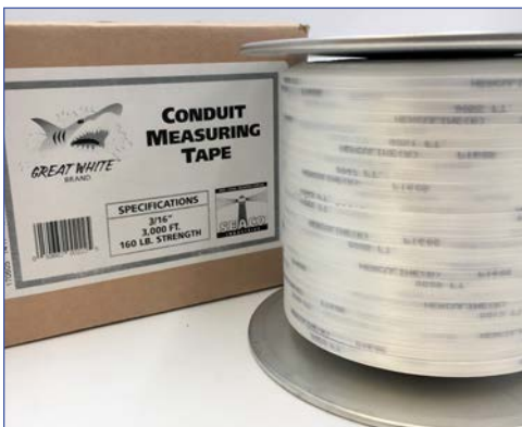
Conduit Pulling Tape