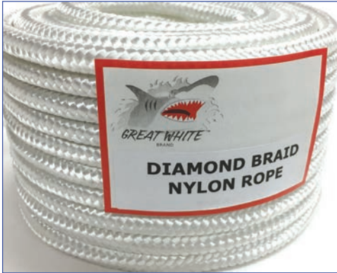
Diamond Braid Nylon Rope