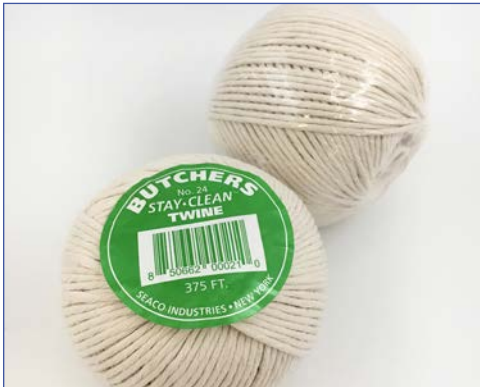
Butcher's Twine Ball