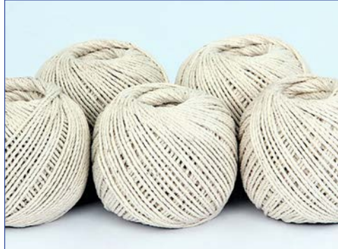
Tying Twine/Cable Cord