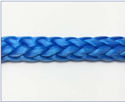
PE-12 Single Braid 12-Strand