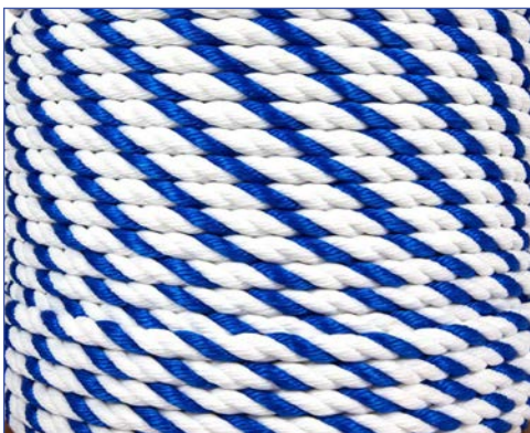
Blue and White Pool Rope