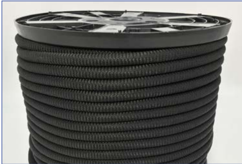
Shock Cord/Bungee Cord