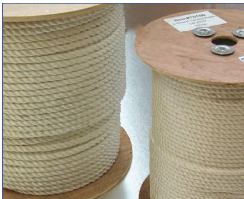
Polyester Rope 3-Strand Twisted