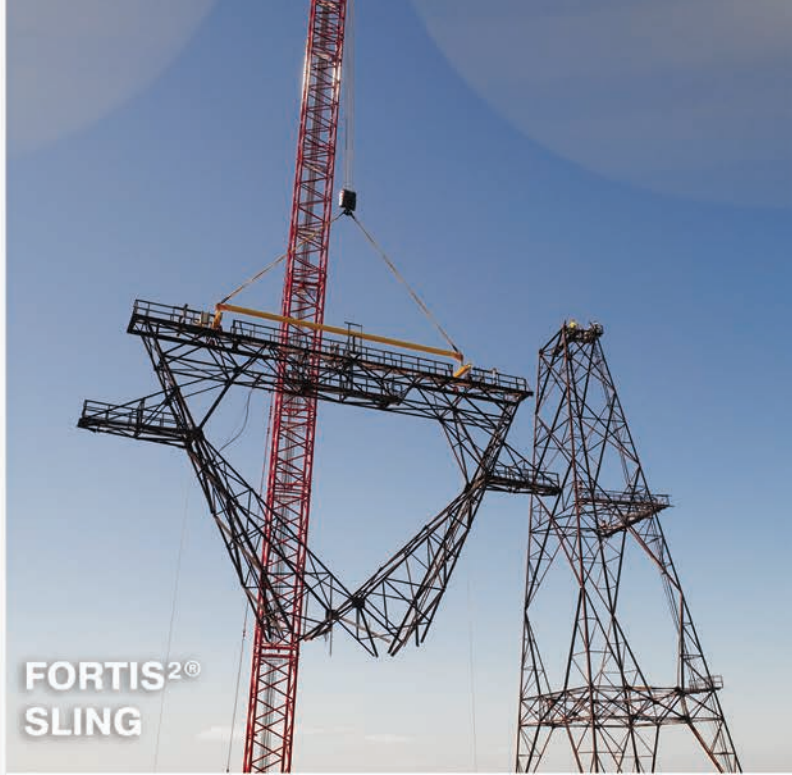
FORTIS 2 ® SLING