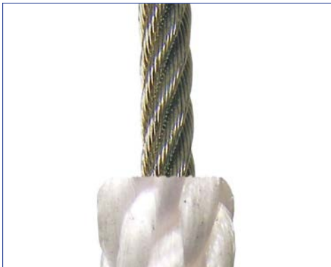
Wire Center Rope