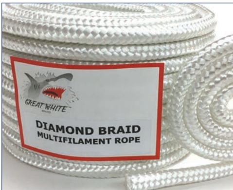
Diamond Braid Multifilament Rope