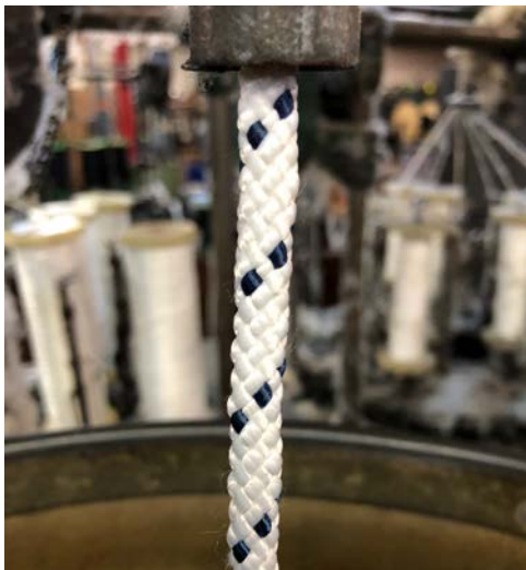
Manufacturing Utility Rope-Made in the U.S.A.

Dielectric Strength: We recommend that you consider all ropes, regardless of their initial new rated dielectric strength, as conductive in service. Dielectric property testing applies only to new, unused clean rope, and holds true only under these ideal conditions. Dirt, grease, moisture, and other contaminants will increase conductivity greatly. Nylon or natural fiber ropes should not be used around energized lines.