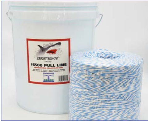
Poly Pull Line