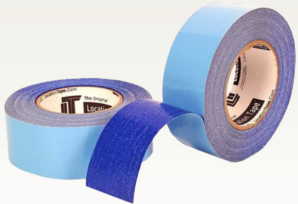
Location Tape-High Tack/Low Tack