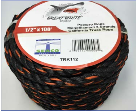
Truck Rope/Black and Orange Polypropylene Rope