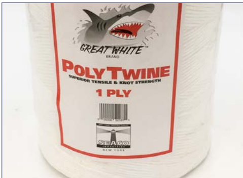
1-Ply Poly Twine