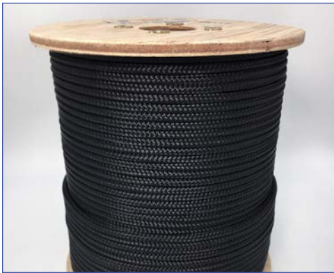
Double Braid Rope without Eyes